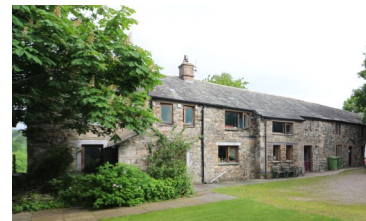
High Row located at the foot of Carrock Fell, The Lake District