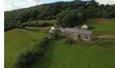
Maes y Lade Centre located in the beautiful Brecon Beacons.