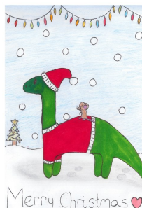
EBGC Christmas Card Winner