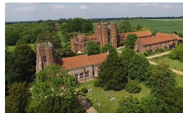
Layer Marney Outdoors, Located near Colchester, Essex